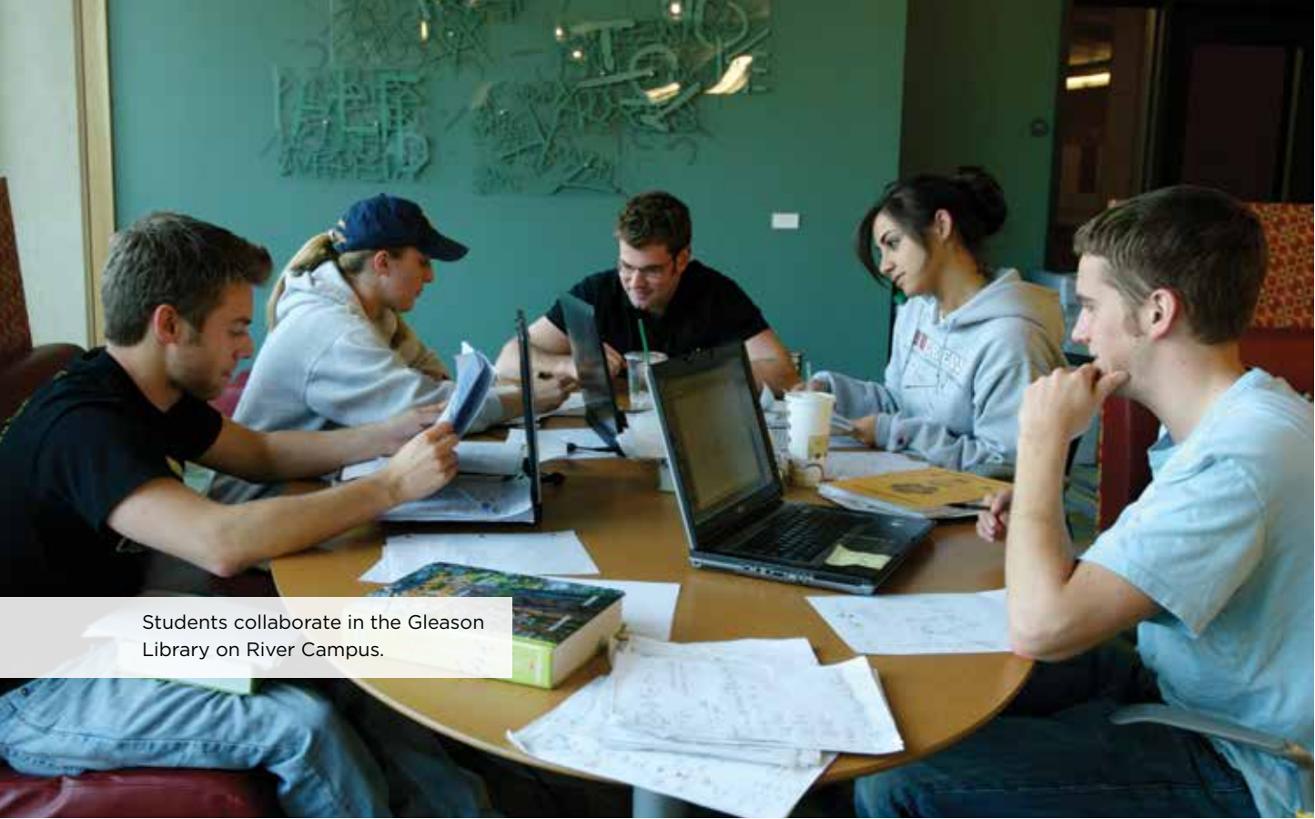
Students collaborate in the Gleason Library on River Campus.

Archives; the Art/Music Library; the Department of Rare Books, Special Collections, and Preservation; the Rossell Hope Robbins Library, which houses works related to medieval studies; and the Gleason Library, which provides a flexible 24/7 study environment.